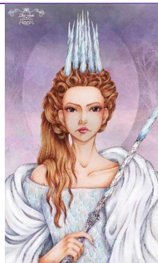
Jadis (the White Witch)

Murdered Harry Potter's parents and tried to kill Harry too. So terrifying that no one dares to use his real name. Has very pale